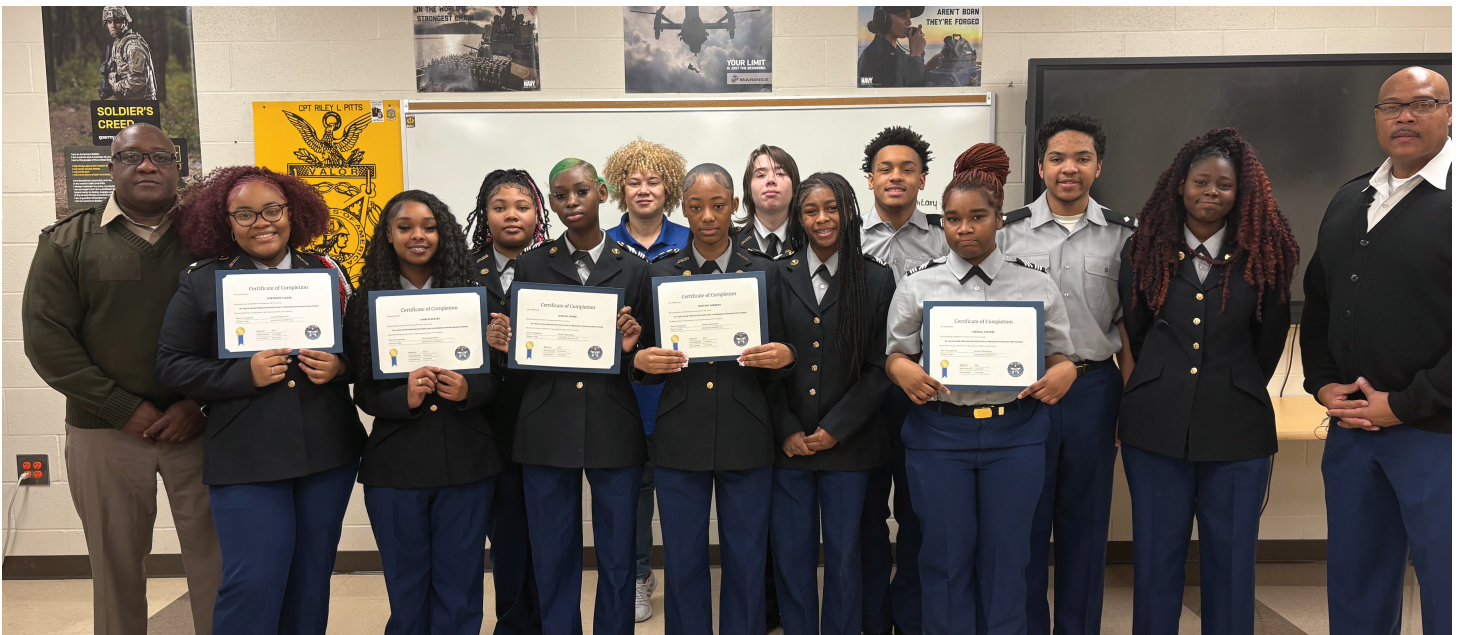
Douglass HS JROTC Graduation photo